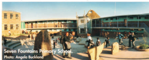
Seven Fountains Primary School.